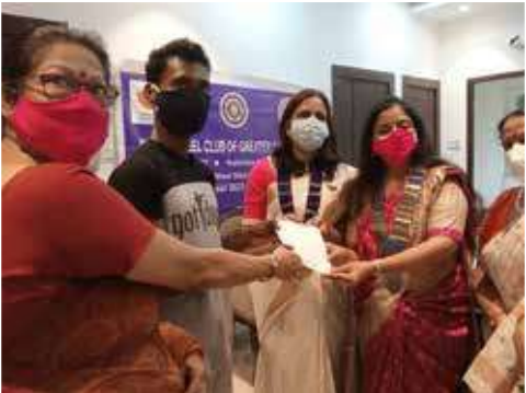
IWC GREATER CALCUTTA