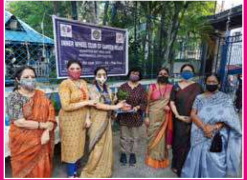
IWC GARDEN REACH