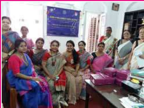
IWC SOUTH CALCUTTA