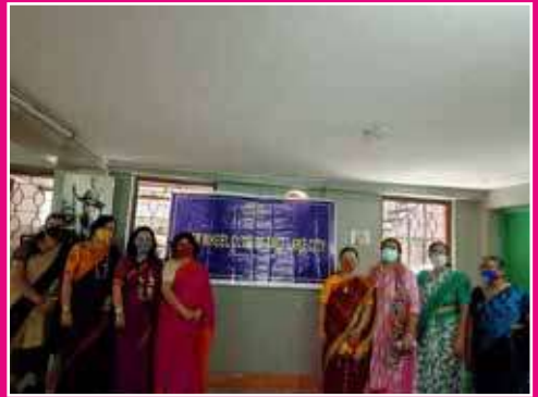
IWC SALT LAKE CITY