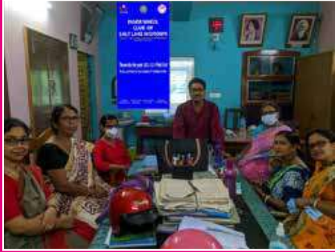
IWC SALT LAKE MID TOWN