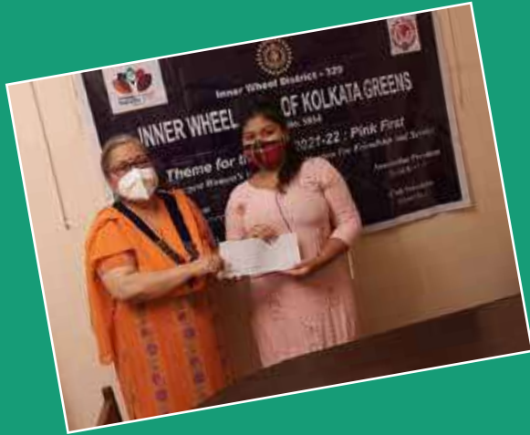
IWC KOLKATA GREENS