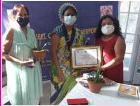
IWC KHIDDERPORE COSMOS