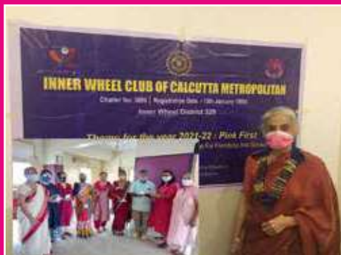
IWC CALCUTTA METROPOLITAN