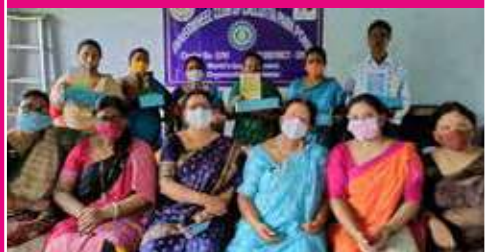
IWC CALCUTTA PARK POINT