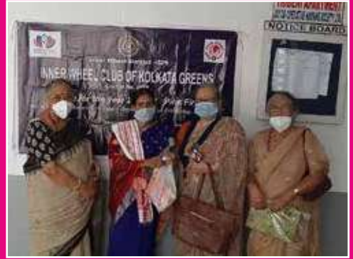
IWC KOLKATA GREENS