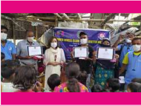
IWC CALCUTTA WEST