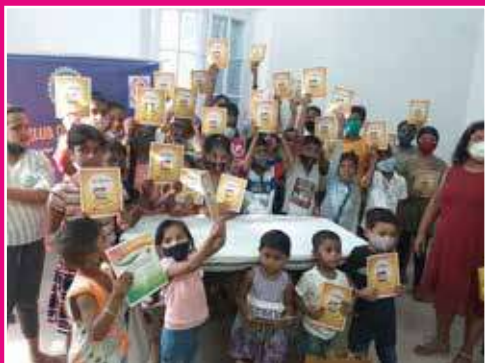
IWC CALCUTTA MID WEST