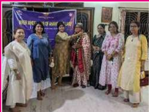
IWC ANAND SALT LAKE