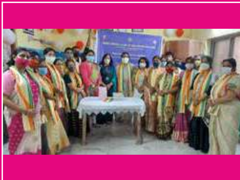
IWC KOLLOLINI KOLKATA