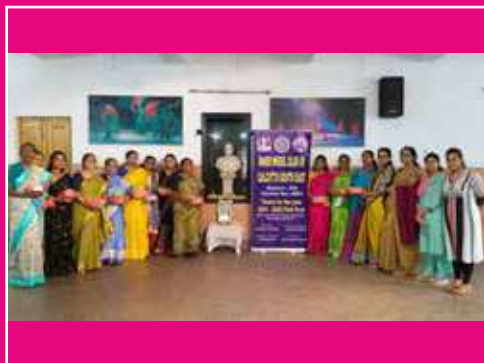
IWC CALCUTTA SOUTH EAST