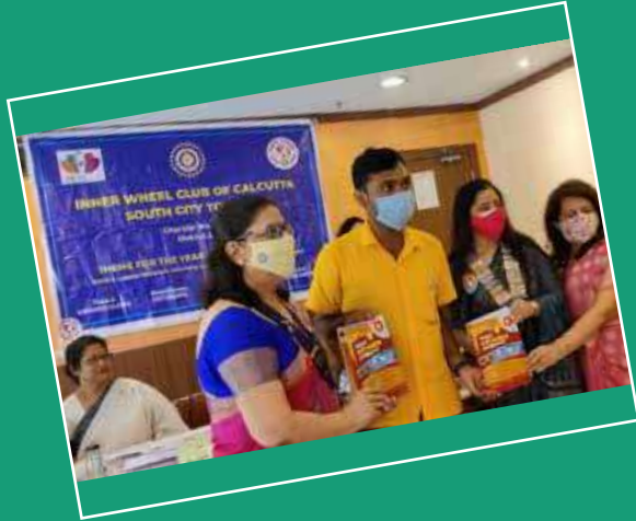
IWC CALCUTTA SOUTH CITY TOWERS