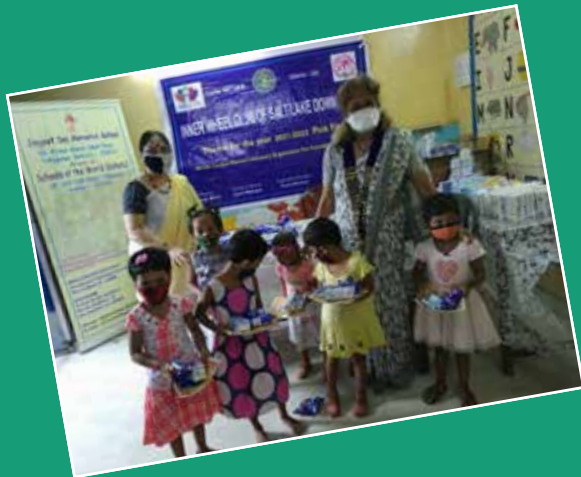
IWC SALT LAKE DOWN TOWN