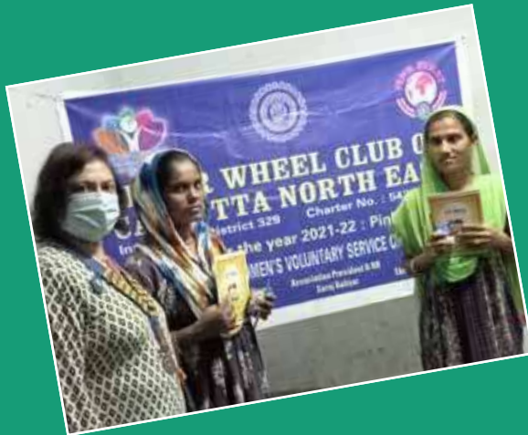
IWC CALCUTTA NORTH EAST