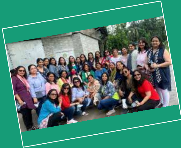
IWC CENTRAL CALCUTTA