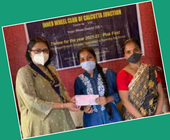
IWC CALCUTTA JUNCTION