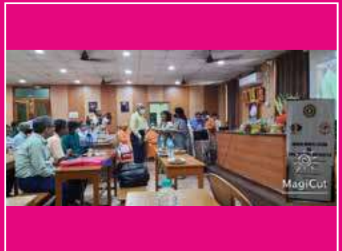
IWC SOUTH WEST CALCUTTA