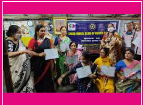
IWC NORTH CALCUTTA