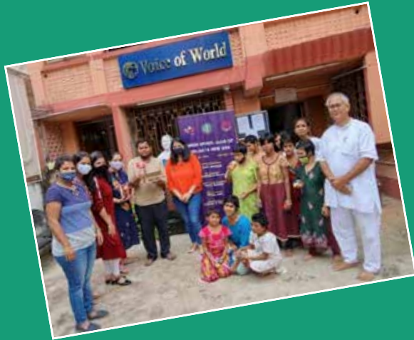
IWC KOLKATA NEW GEN