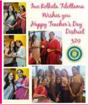
IWC KOLKATA TILOTTAMA