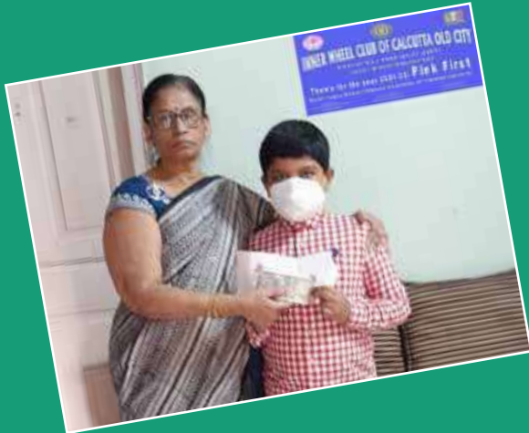
IWC CALCUTTA OLD CITY